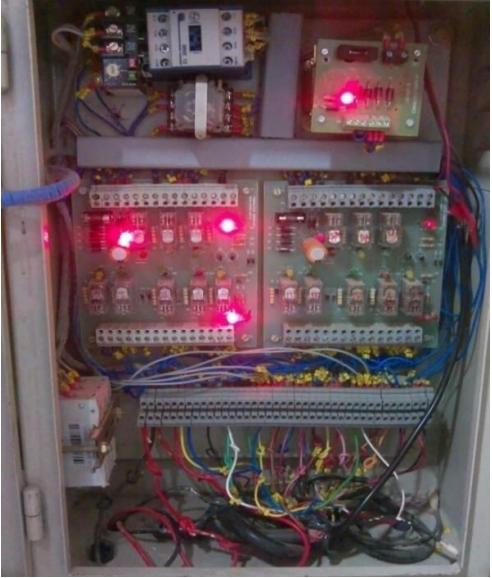
Fig(3): controlling part of conventional elevator