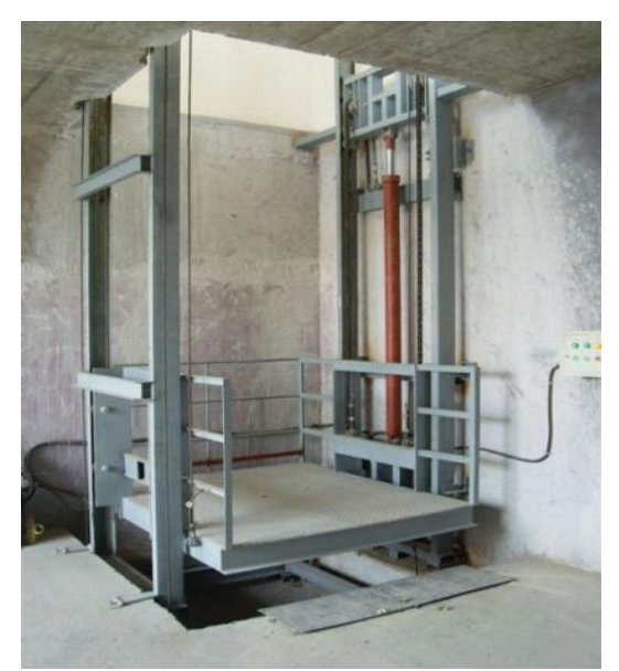
Fig(1): Hydraulic Elevator

For most people residing in urban cities, elevators have become an integral part of their daily life. Simply stated, an elevator is a hoisting or lowering mechanism, designed to carry passengers or freight, and is equipped with a car and platform that typically moves in fixed guides and serves two or more landings. Hydraulic and roped elevators are the two types of elevators in use today. The main design considerations for choosing either electric traction drive or hydraulic for a particular project are the number of floors, the height of the building, the number of people to be transported, desired passenger waiting times and frequency of use. The circuit of conventional elevator is very complex as relays are used for controlling purpose. Since relays were used, most of the connections were made by wires and this is the reason for complexity of the conventional elevator. In such complex circuit error detection and correction is very difficult and to find out error, the whole circuit has to be checked which consumed more will time to search error. This project is to design and construct an elevator using a microcontroller which will overcome the limitations mentioned above.