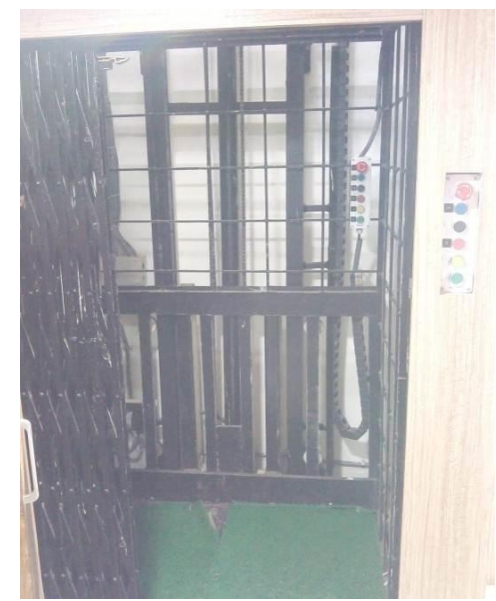
Fig (2) Elevator circuit seen at Asmita Engineering Equipment